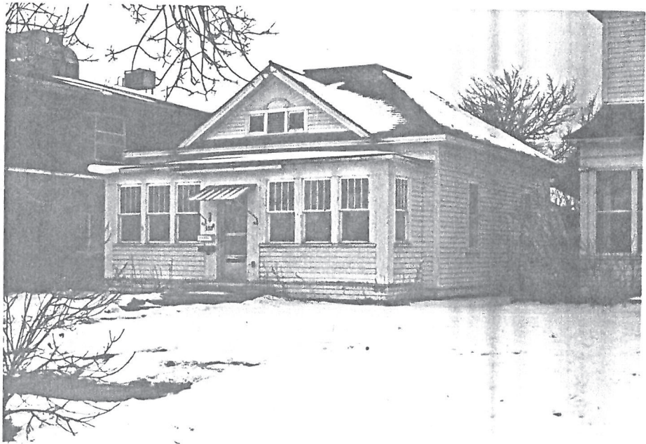
Roll# 15 Frame# 13

Legal Description: Havre Original Townsite, Block 19, Part of Lot 2 and Part of Lot 3