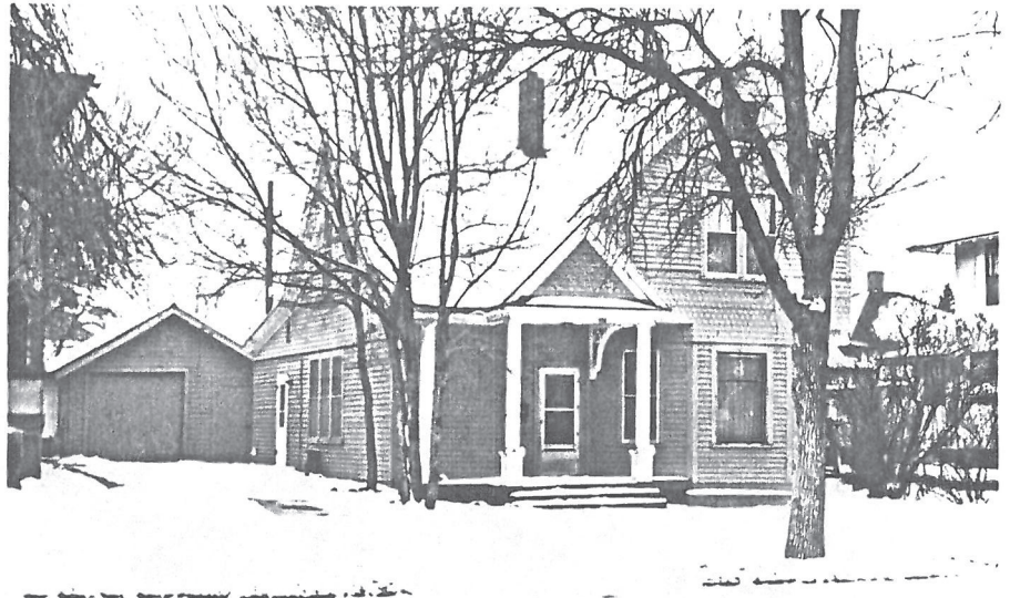
Roll# 3 Frame# 9

Legal Description: Meili-Almas Addition, Block 7, Part of Lots 1, 2, 3, 4 and 5