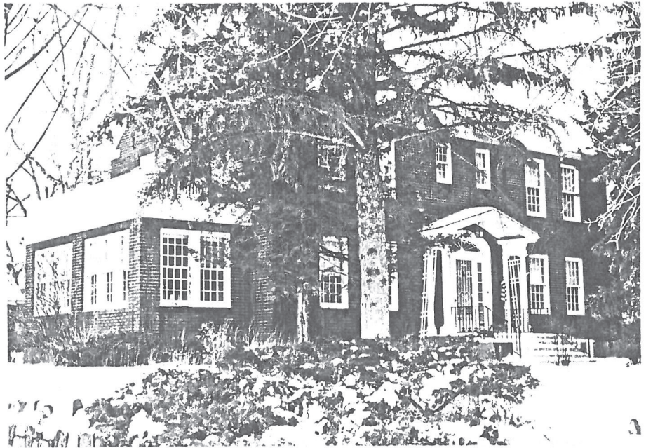
Roll# 3 Frame# 21-23

Legal Description: Broadwater Addition, Block 1, All of Lots 11, 12 and 13 and part of Lot 14.